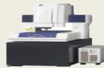
Vision Measuring Systems